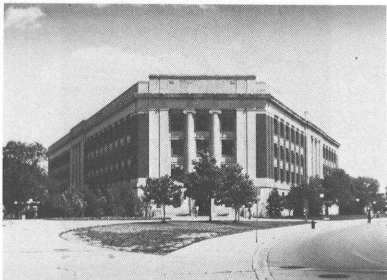
Alexander G. Ruthven Museums Building, The University of Michigan