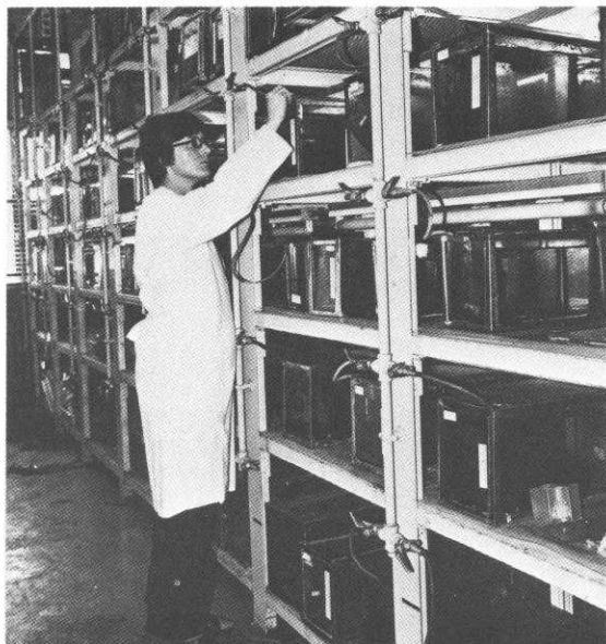
Mollusk aquarium facility.