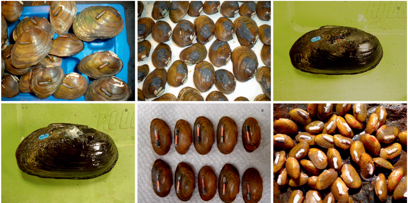
Figure 1. Marking of Northern Riffleshell ( Epioblasma rangiana ) and Clubshell ( Pleurobema clava ) by (a) attaching passive integrated transponder (PIT) tags to shells with cyanoacrylate and (b) encapsulating PIT tags in epoxy resin; Eastern Elliptio ( Elliptio complanata ) by using cyanoacrylate by (c) attaching PIT tags to shell and (d) encapsulating the PIT tag in cyanoacrylate; and Cumberland Combshell ( Epioblasma brevidens ) by (e) attaching a PIT tag to the shell with cyanoacrylate and (f) encapsulating the PIT tag in dental cement.

Animals have since been monitored to estimate the survival and gauge the success of the project (Stodola et al. in review). Of the 3,749 animals tagged and relocated, 3,371 (90%) have been encountered at least once during subsequent recapture monitoring by using a portable submersible PIT tag antennae.