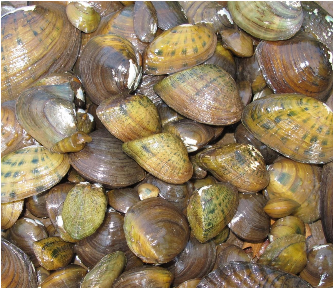
Middle Island Creek mussels including federally endangered Snuffbox.