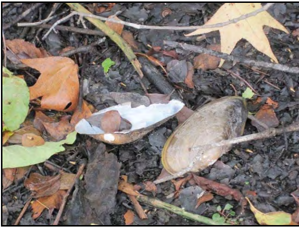
Anodonta cataracta found on exposed shoreline. Williams Pond, Seaford, Delaware.