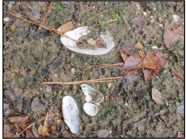
Elliptio fisheriana , Anodonta cataracta and Corbicula on exposed shoreline, Williams Pond. Seaford, Delaware.