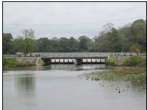
Williams Pond Dam, Seaford, Delaware, Sussex County.

Williams Pond is located on the Nanticoke River System. In 1954 a branch of the river was dammed off which created the pond. The dam is located in Seaford, Delaware and Williams Pond extends northeast from that point out of the city limits for about a mile and a half. Williams pond is crossed by two bridges. The first is for dual highway, Route 13 (Sussex Highway) and is in the middle of the pond. The second is The Tharp Road Bridge at the northeastern end of the pond. The area from the Route 13 bridge to The Tharp Road Bridge on the pond is surrounded by private waterfront homes. On August 6th, 2010 Del Dot drew down the water in Williams Pond by approximately 1.5 meters to facilitate repair of the dam structure. This draw down of water exposed previously flooded shoreline around the lake.