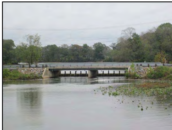
Williams Pond Dam, Seaford, Delaware, Sussex County.

Williams Pond is located on the Nanticoke River System. In 1954 a branch of the river was dammed off which created the pond. The dam is located in Seaford, Delaware and Williams Pond extends northeast from that point out of the city limits for about a mile and a half. Williams pond is crossed by two bridges. The first is for dual highway, Route 13 (Sussex Highway) and is in the middle of the pond. The second is The Tharp Road Bridge at the northeastern end of the pond. The area from the Route 13 bridge to The Tharp Road Bridge on the pond is surrounded by private waterfront homes. On August 6th, 2010 Del Dot drew down the water in Williams Pond by approximately 1.5 meters to facilitate repair of the dam structure. This draw down of water exposed previously flooded shoreline around the lake.