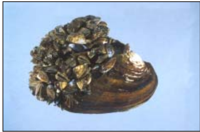
colony of zebra mussels

Habitat: lakes and rivers of all sizes; attaches to almost any hard surface