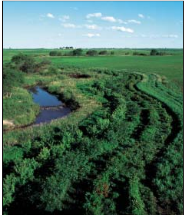
riparian buffer strip

Buffer strips of grasses and/or trees between water and land help keep chemicals and other pollutants from reaching the water.