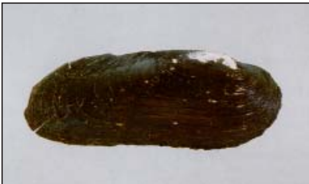
spectacle case – endangered in Iowa

Exotic species compete with native freshwater mussels for food and habitat. Zebra mussels also attach directly to mussel shells. Colonies of zebra mussels cover shells so they can no longer open. The “host” mussel eventually suffocates or starves. Also, mussel reproduction is limited since it can not “lure” host fish through the attached zebra mussels.